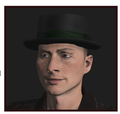
character concept created with Fuse

Clint Blackwood (Father, estranged) Nancy Blackwood (Mother, deceased)