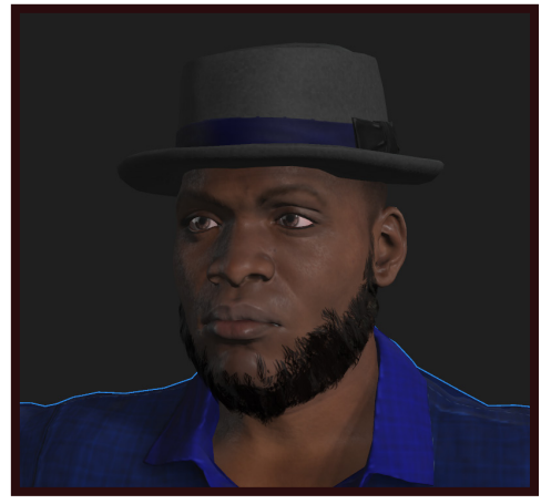
character concept created with Fuse

hip. A long scar runs across his left cheek.